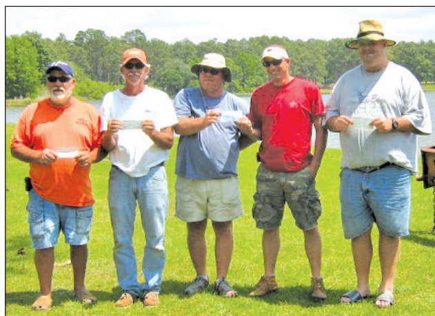
19th Annual Shellcracker Tournament Winners